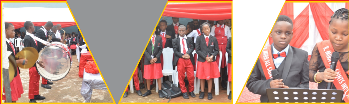
ROYAL MIRA BRITISH COLLEGE