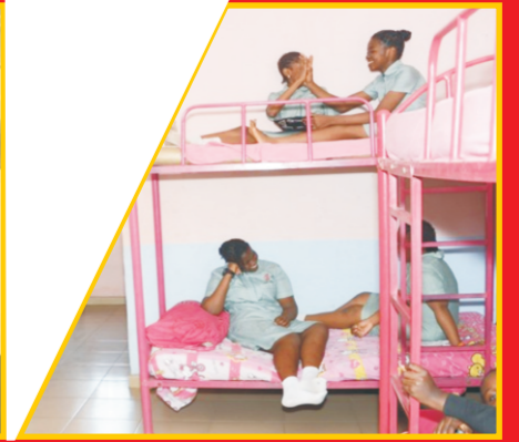
ROYAL MIRA BRITISH COLLEGE