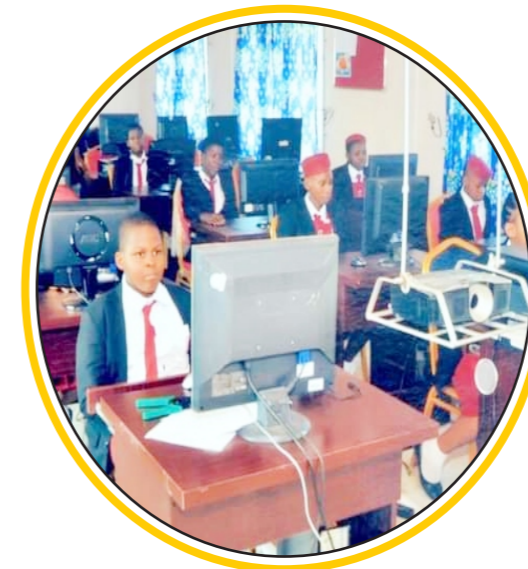
21st Century ICT Laboratory