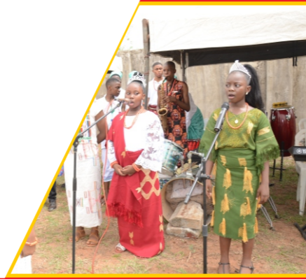
ROYAL MIRA BRITISH COLLEGE