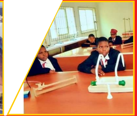
ROYAL MIRA BRITISH COLLEGE