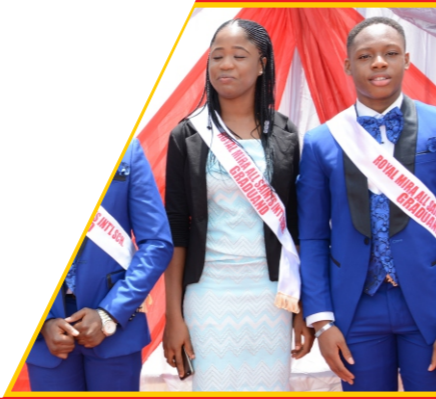
ROYAL MIRA BRITISH COLLEGE