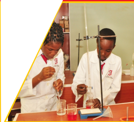
ROYAL MIRA BRITISH COLLEGE