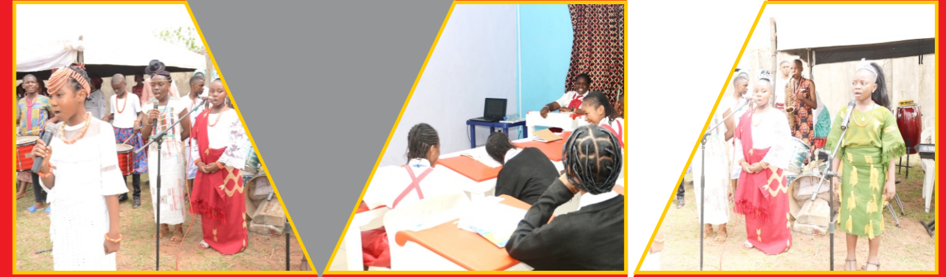
ROYAL MIRA BRITISH COLLEGE

Speech Day Recreational Activities Career Guidance Inter-Class Quiz & Debate Outdoor & Indoor Games