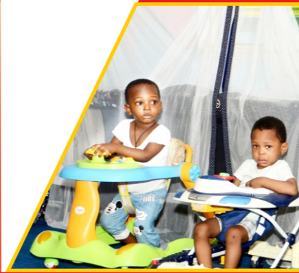
ROYAL MIRA BRITISH COLLEGE