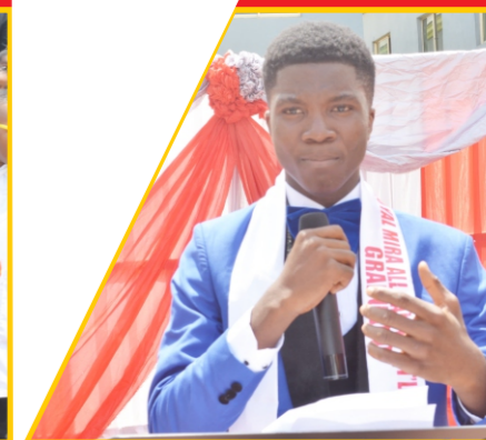
ROYAL MIRA BRITISH COLLEGE