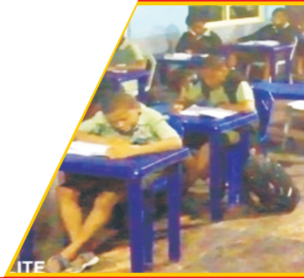
ROYAL MIRA BRITISH COLLEGE