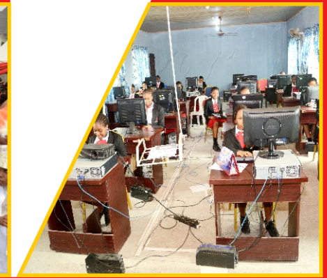
ROYAL MIRA BRITISH COLLEGE