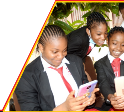
ROYAL MIRA BRITISH COLLEGE

However, any indisciplined action is given a commensurate sanction by the disciplinary committee.